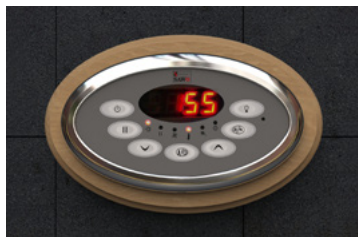
Classic Control (for steam generators)