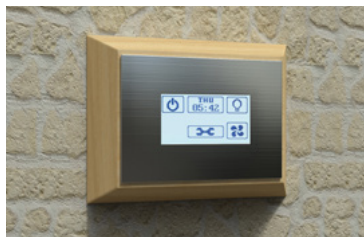
Stainless Steel Touch Control (for steam generators)