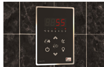
Classic 2.0 Control (for steam generators)